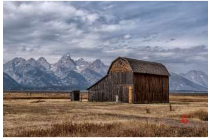
Photo 7 has a little bright white cloud in the upper left corner that keeps pulling the eye. So I cropped it out, but this time I also changed the ratio to a 4x5 which really changes this scene in photo 8.