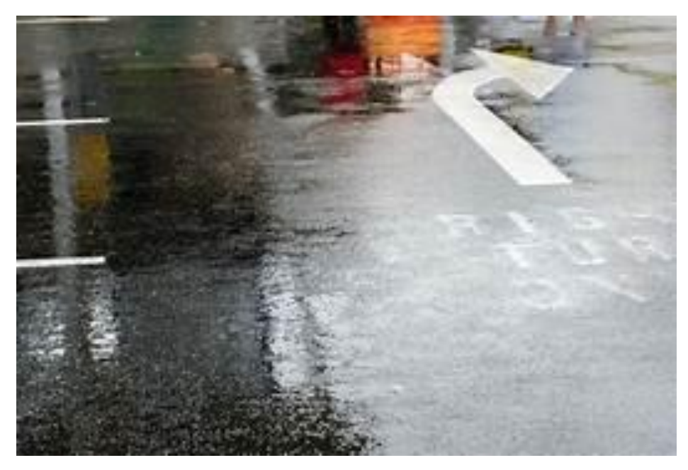
Seeing Fresh: The Practice of Contemplative Photography - Henri-Cartier Bresson