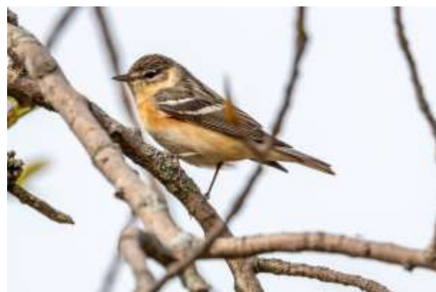
A Yellow throated warbler among the tree limbs that were constantly a problem with focusing.