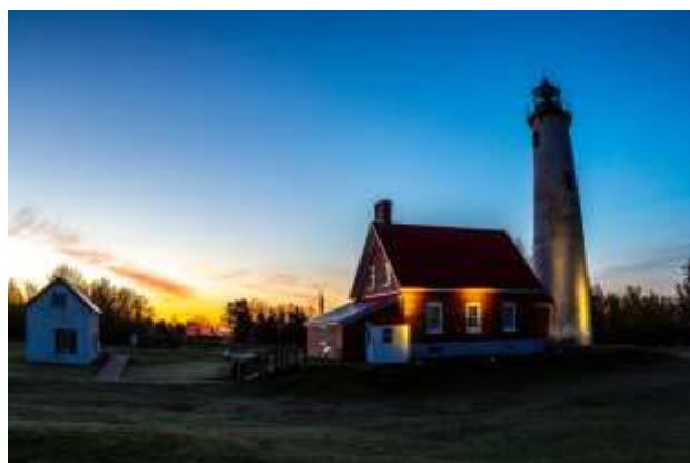
Sunrise at the Tawas Point Lighthouse.