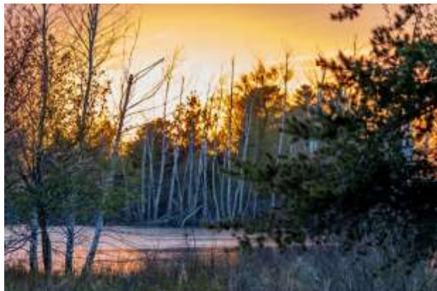
Sunset over one of the ponds at Tawas Point State Park.

The Tawas Point outing offered many opportunities for sunrise/sunset photos, and birds of all types in a very relaxed atmosphere. You could always go back to the camper for meals, snacks or a nap. Had a great time. Thank you Todd Bielby and the SPCC.